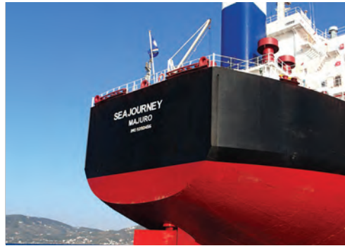
SEA JOURNEY (Thenaris (Ships Management) Inc.)