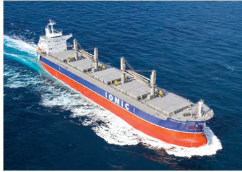
IONIC UNITED (IONIC Shipping (MGT) Inc.)