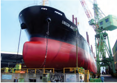
UNION MARK (Union Commercial Incorporated)