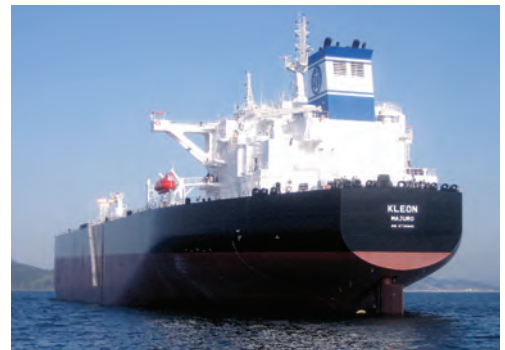
KLEON (Halkidon Shipping Corporation)