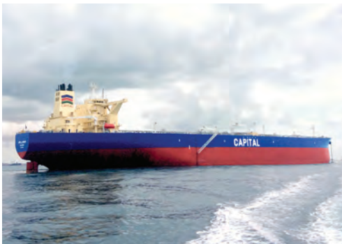
APOLLONAS (Capital Ship Management Corp.)