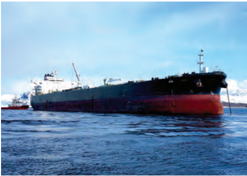
ACE (NGM Energy S.A.)