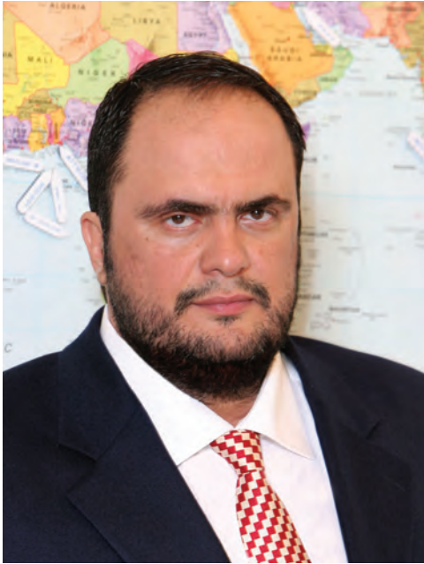
Mr. Evangelos Marinakis, Founder and Chairman of Capital Maritime & Trading Corp. and Capital Ship Management Corp.

The RMI Registry recognizes the importance of safety, security, technological innovation, and environmental awareness and strives to commend tremendous contributions to the industry by its owners and operators. IRI/The Marshall Islands Registry is pleased to award Mr. Evangelos Marinakis for his ongoing commitment to upholding these outstanding values in the shipping industry and