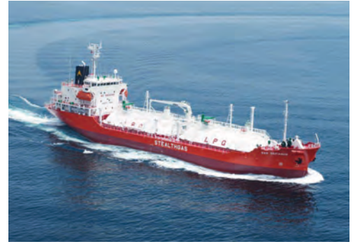
GAS DEFIANCE (Stealth Maritime Corporation S.A.)