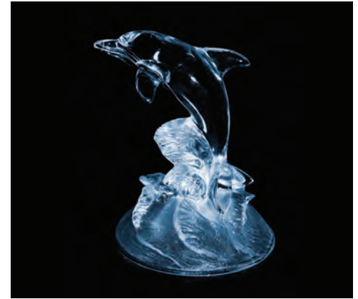
The Xenakoudis Excellence in Shipping Award.