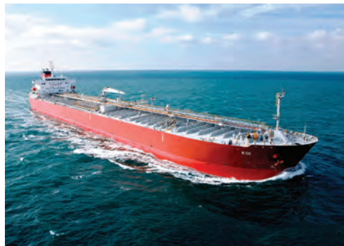
KOI (Prime Tanker Management Inc.)